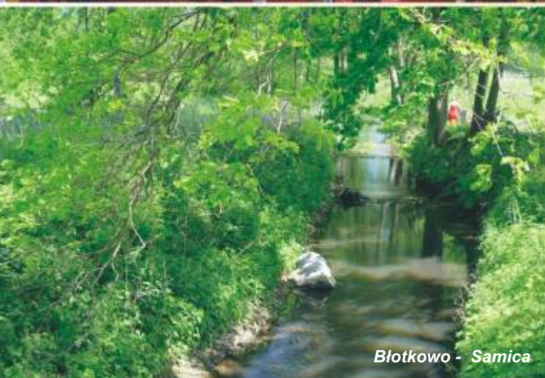
Błotkowo - Samica

On a such small terrain, where 74% is placed with agrar areas, there is an unusual wealth in sacral monuments and the surrounding landscape. This places can be visited during a bicycle trip. We invite you to ride this route with us!