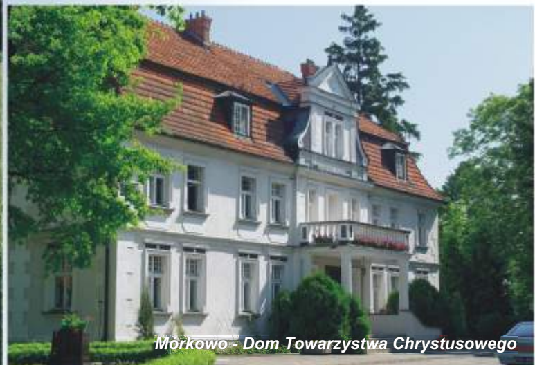
Morkowo - Dom Towarzystwa Chrystusowego