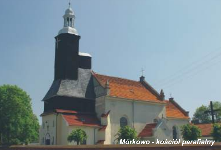
Mórkowo - kościół parafialny