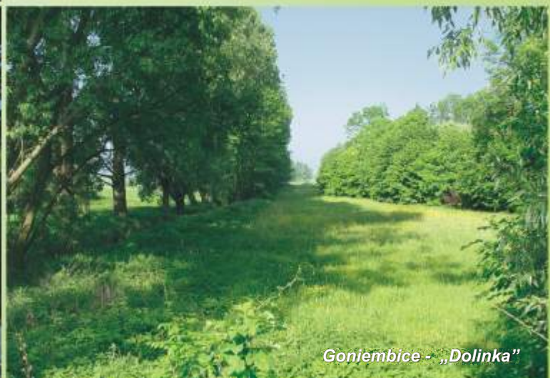
Goniembice - „Dolinka”